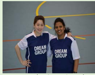
Team-B (Melai & Bhagya)